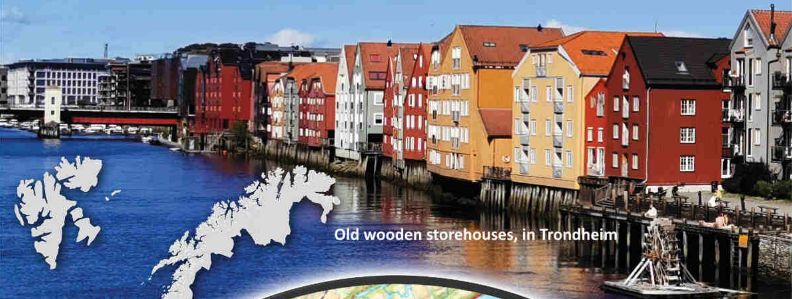
Old wooden storehouses, in Trondheim